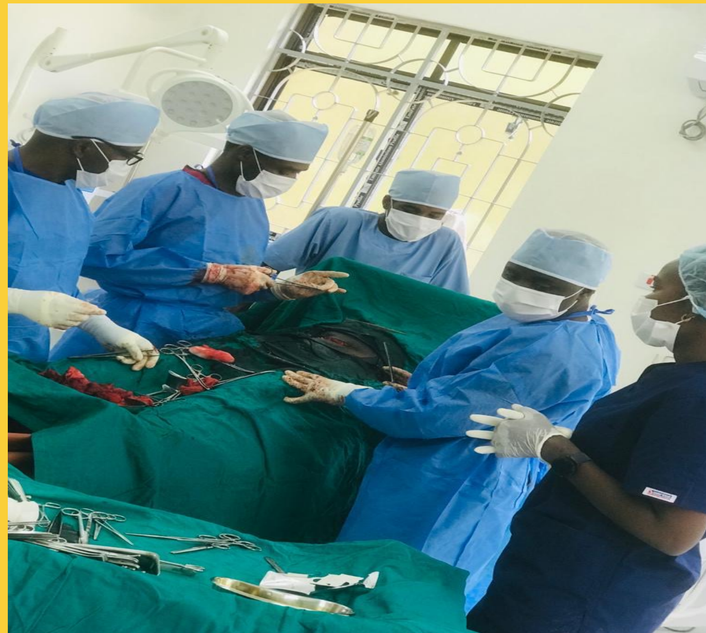
Surgeries, including c-sections are now being performed in the rural village at Maruku Health Center.

Health Care Facilities: Hospitals, clinics or dispensaries have been built resulting in dramatically improved maternal, infant and child survival rates.