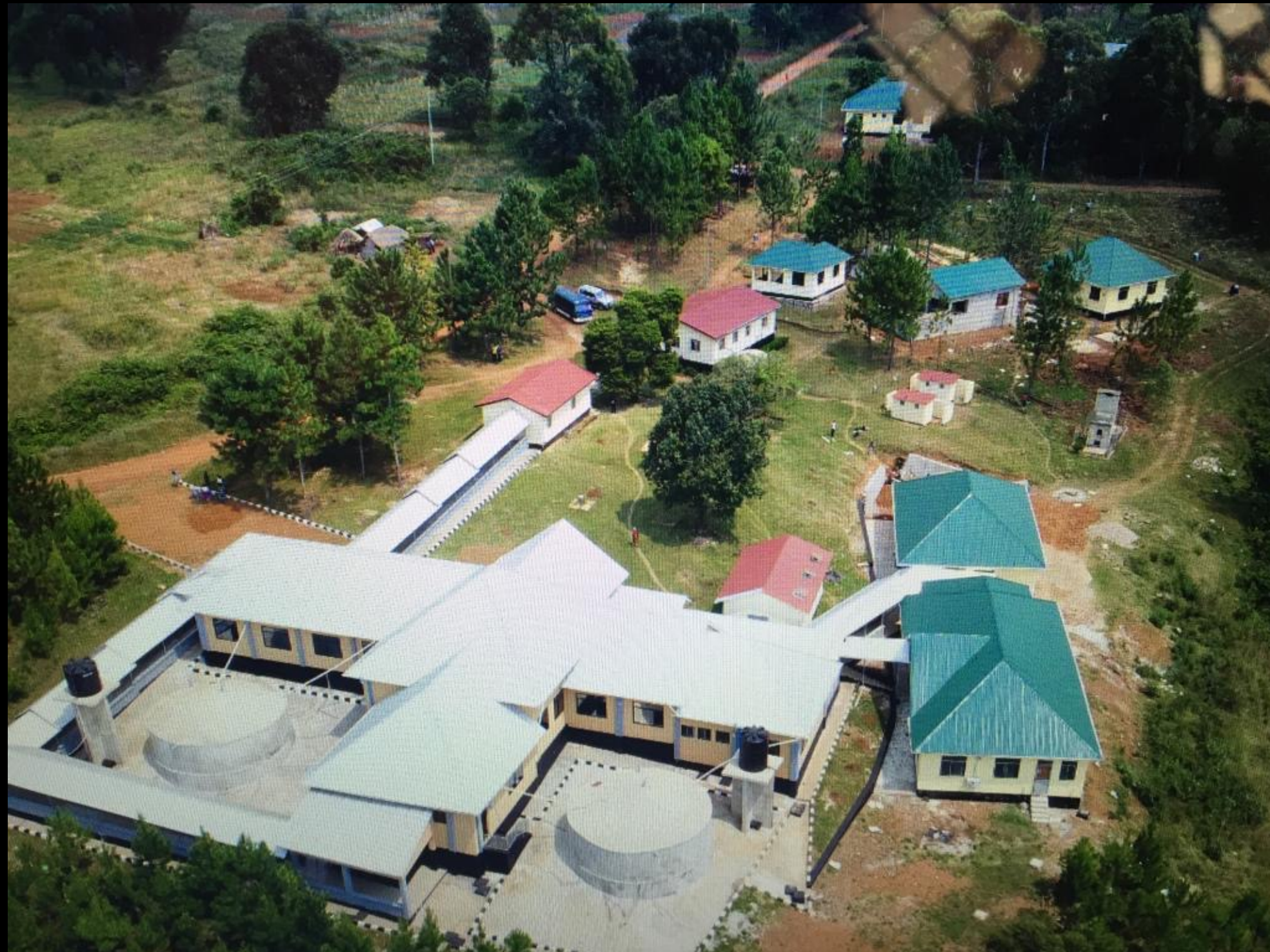
The Maruku Health Center handover ceremony was held in July 2019