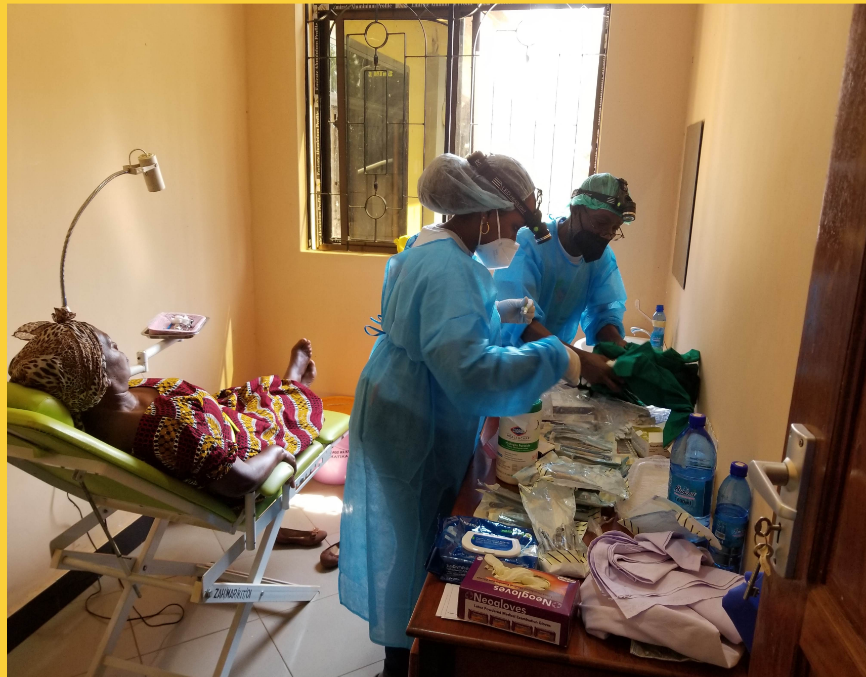
Volunteers providing free dental care for patients at The Maruku Health Center.

Purpose: The primary objective of the symposium is to initiate a dialogue on the importance of enhancing healthcare services within our borders, and to cultivate strong leadership in the healthcare sector. Simultaneously we seek to promote innovation and foster enhanced collaboration amongst healthcare professionals nationally and globally.