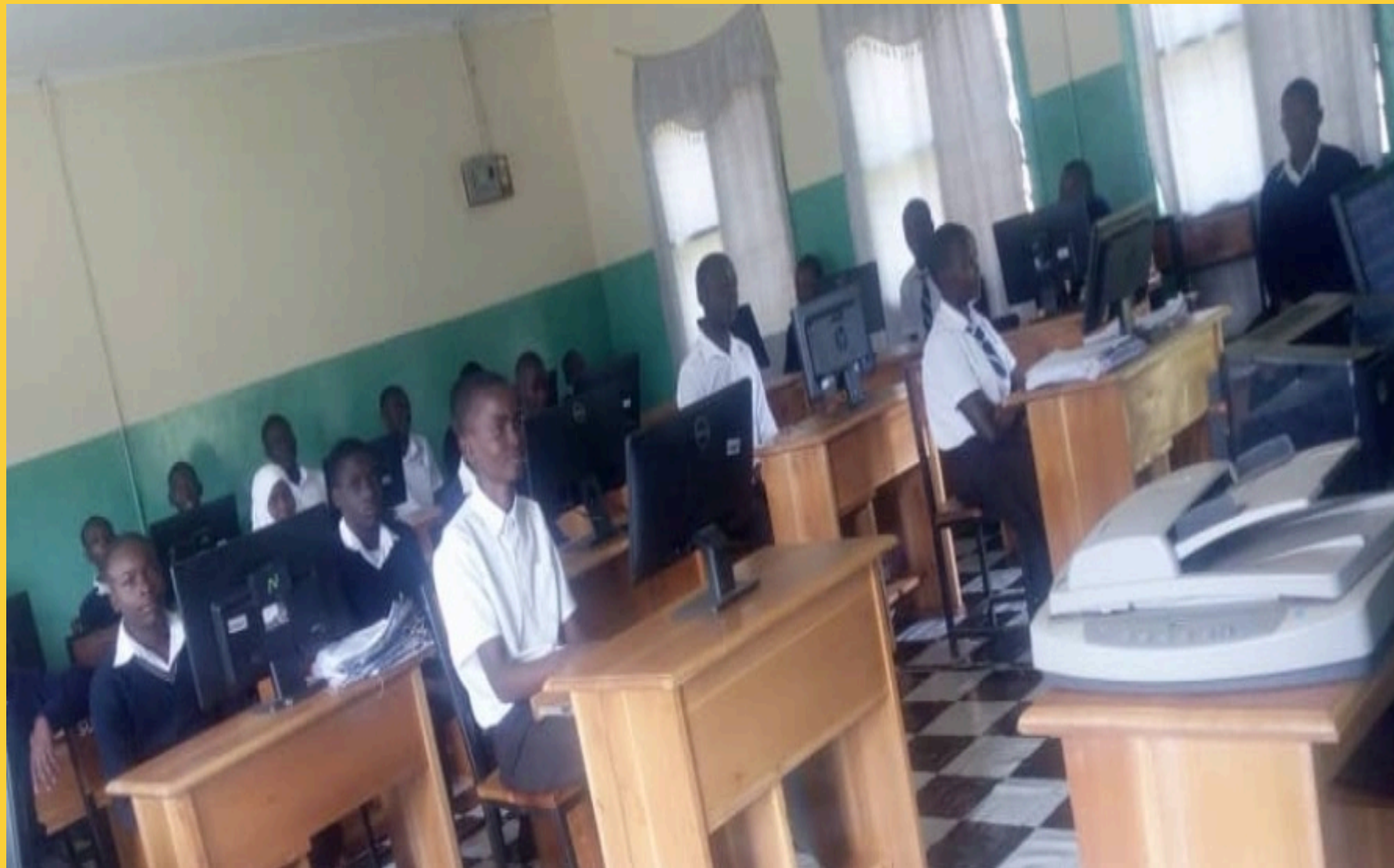
In partnership with AHEAD Tanzania, Maruku Secondary School now has a computer lab with computers and internet.