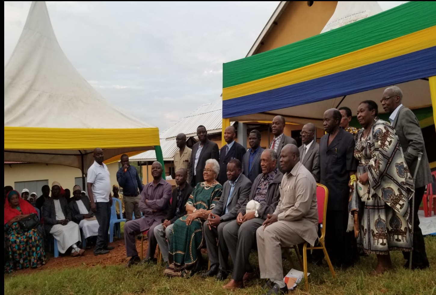
AHEAD INC & AHEAD TANZANIA Maruku Health Center Handover Ceremony

Bank details: NMB Bank Account Name: AHEAD Tanzania Swift Code: NMIBTZZ Account #: 31810014237