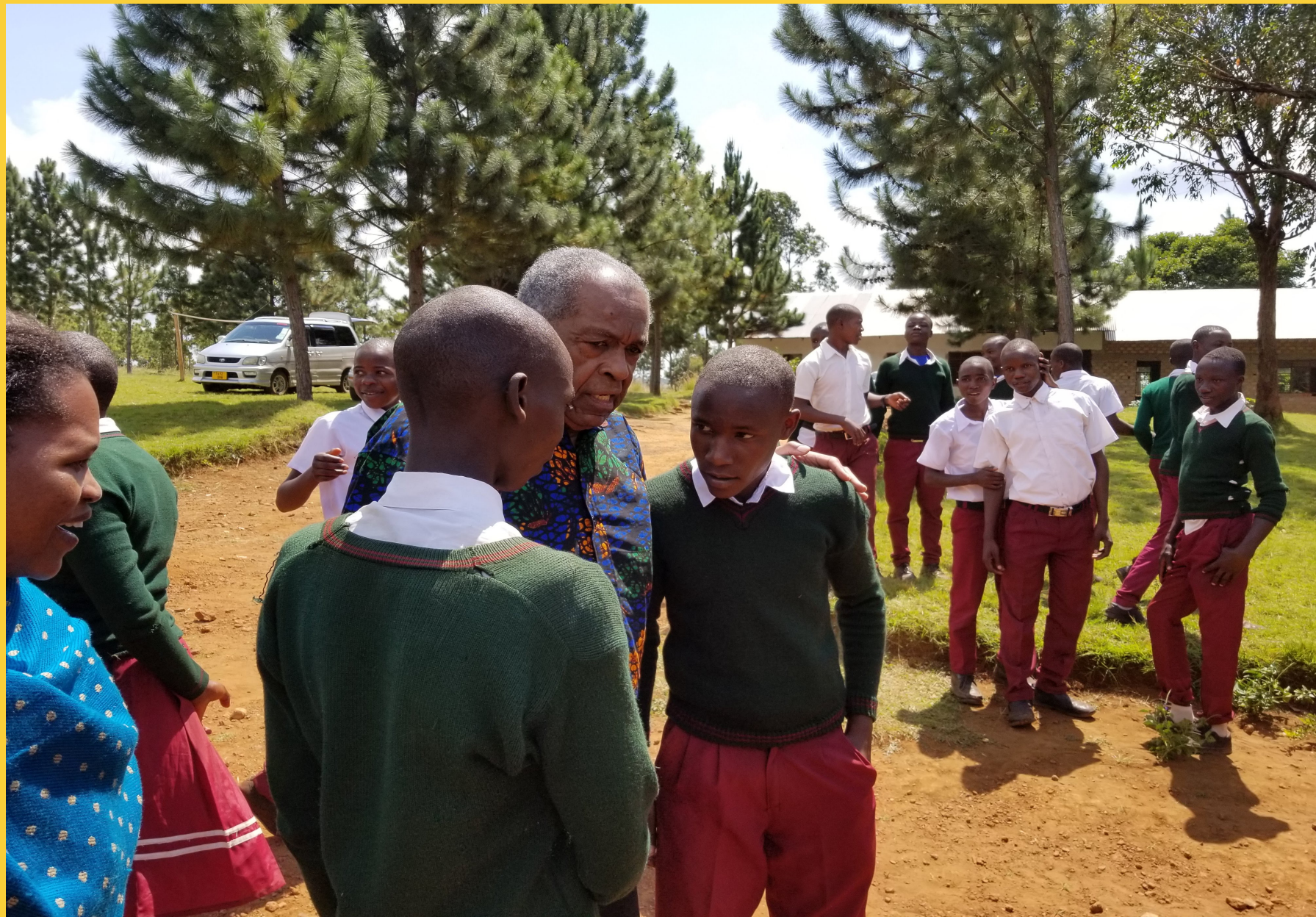
Bukara Secondary School Students in discussion with our Medical Director Emeritus.